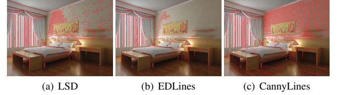
Fig. 3. Line segments detection results of LSD ( N = 898 , L/N = 56.5 ), EDLines ( N = 625 , L/N = 54.2 ) and CannyLines ( N = 823 , L/N = 108.1 ) on an indoor image.

door scene images, over which the average precision of the proposed CannyPF edge detector is 90.9%, which is obviously higher than 86.7% of ED and 85.9% of EDPF.